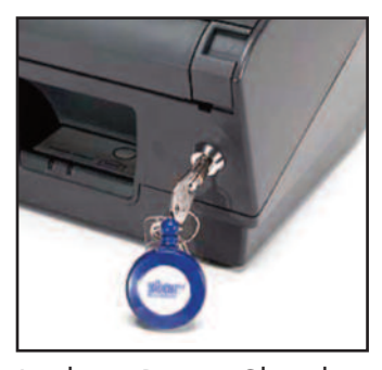
Locking Paper Chamber