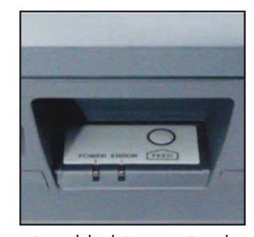
Disabled Paper Feed Button